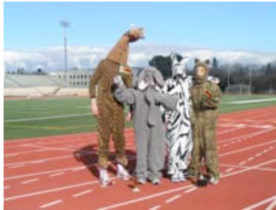
SLF CONDUCTS GAMES & SKITS; MAKES PRESENTATIONS TO SCHOOLS.