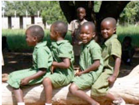
SLF RAISES VITAL FUNDS FOR MAKUMBI CHILDREN'S HOME IN ZIMBABWE.