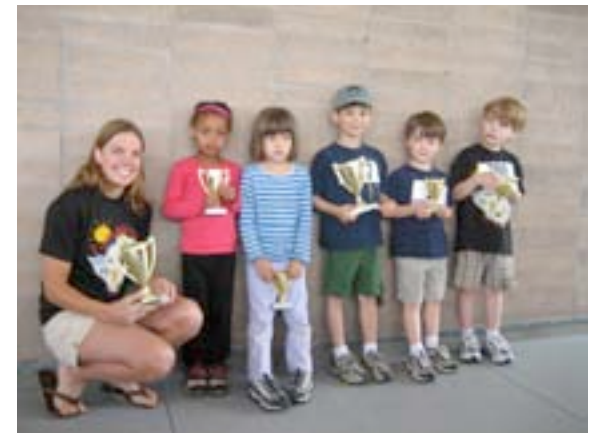
SLF PROVIDES "RUNNERSHIPS". INSPIRES AND REWARDS ALL AGES. THERE ARE 12 X-COUNTRY RACES AT THE RUN— 100 YD. LION HEARTED RUN; 220 YD. PRE-SCHOOL, ½ MILE KINDERGARTEN; MILE RACES FOR GRADE SCHOOL, HIGH SCHOOL AND ADULT RUNNERS.