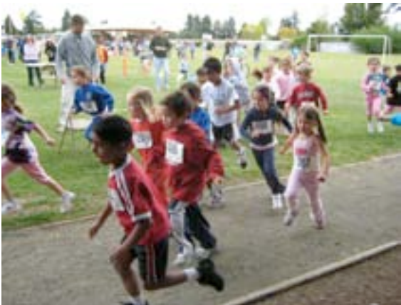
SLF STAGES THE ANNUAL RUN FOR ZIMBABWE ORPHANS TO PROMOTE PHYSICAL FITNESS