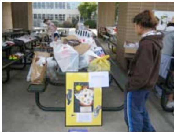
SLF ENGAGES ALL CHILDREN IN TWO-WAY PHILANTHROPY. Shoe Drive for Africa.