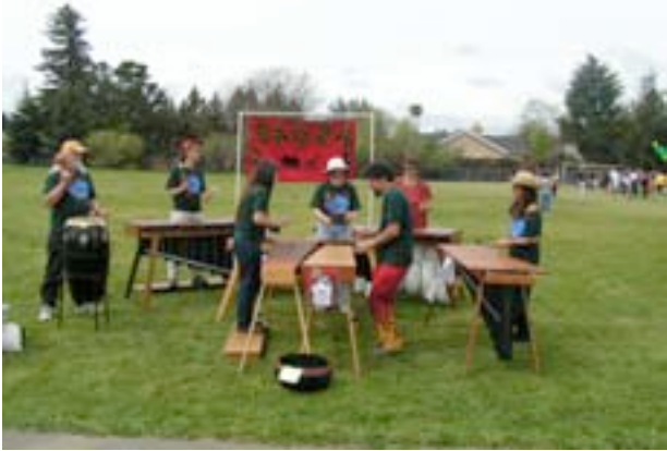
SLF PUTS ON THE ZIMBABWEAN FAIR WITH THE MUSIC, ART, FOOD & CULTURE OF ZIMBABWE. SADZA BAND!