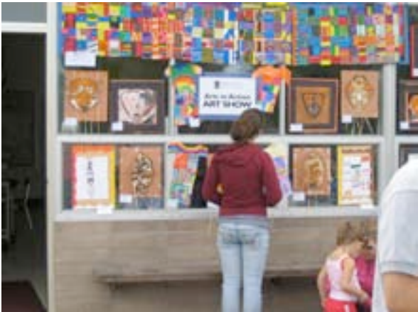
SLF SHOW CASES CHILDREN'S ART